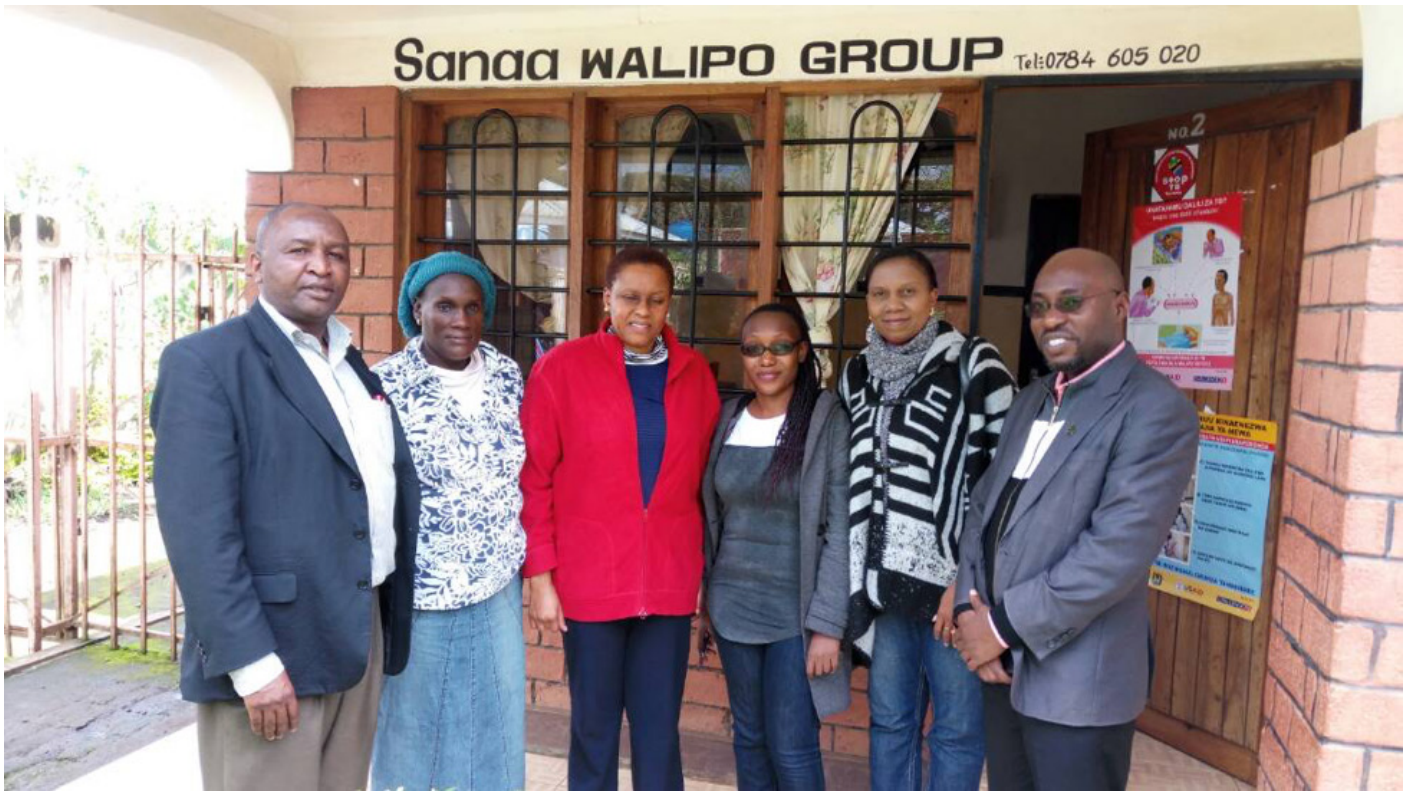
The Challenge TB team visits with Sanaa WALIPO leaders following supportive supervision and mentoring at the Sanaa WALIPO office.