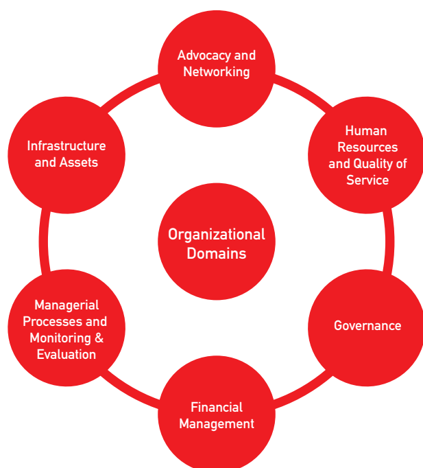
Figure 1. Key areas for capacity-building focused on six organizational domains.