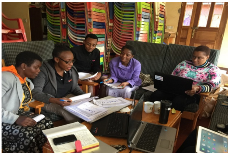
A Challenge TB capacity-building technical officer reviews financial documents during mentorship with Upendo Na Matumaini.