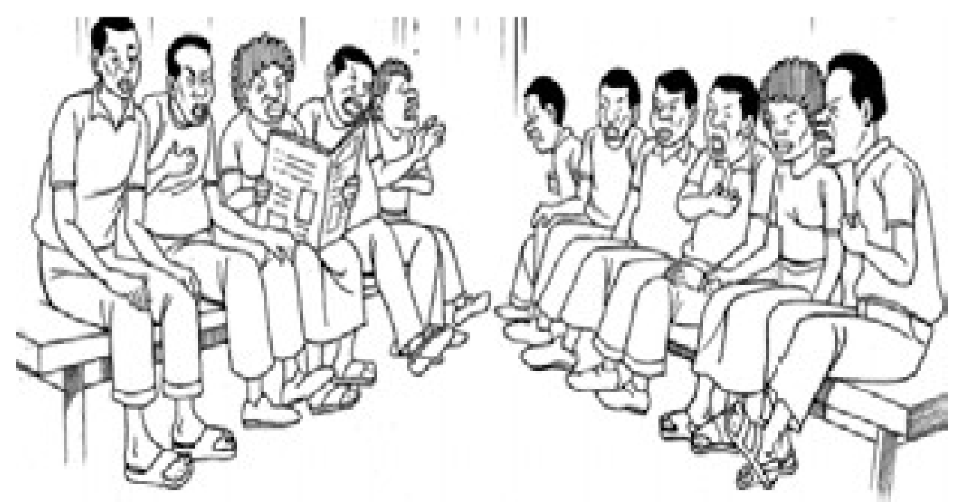
Crowded waiting area